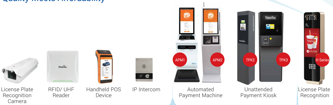
License Plate Recognition Camera