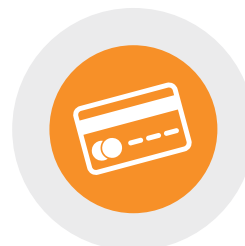
Credit/ Debit Card